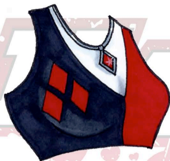
HARLEY'S HALTER TOP, JEANS, & BOOTS BY CHAD HARDIN IN HARLEY QUINN VOL. 2, No. 8 (2014)

FOR MORE COMIC BOOK-THEMED PAPER DOLLS VISIT: HTTP://POPCULTURE.LOOKINGLAND.COM