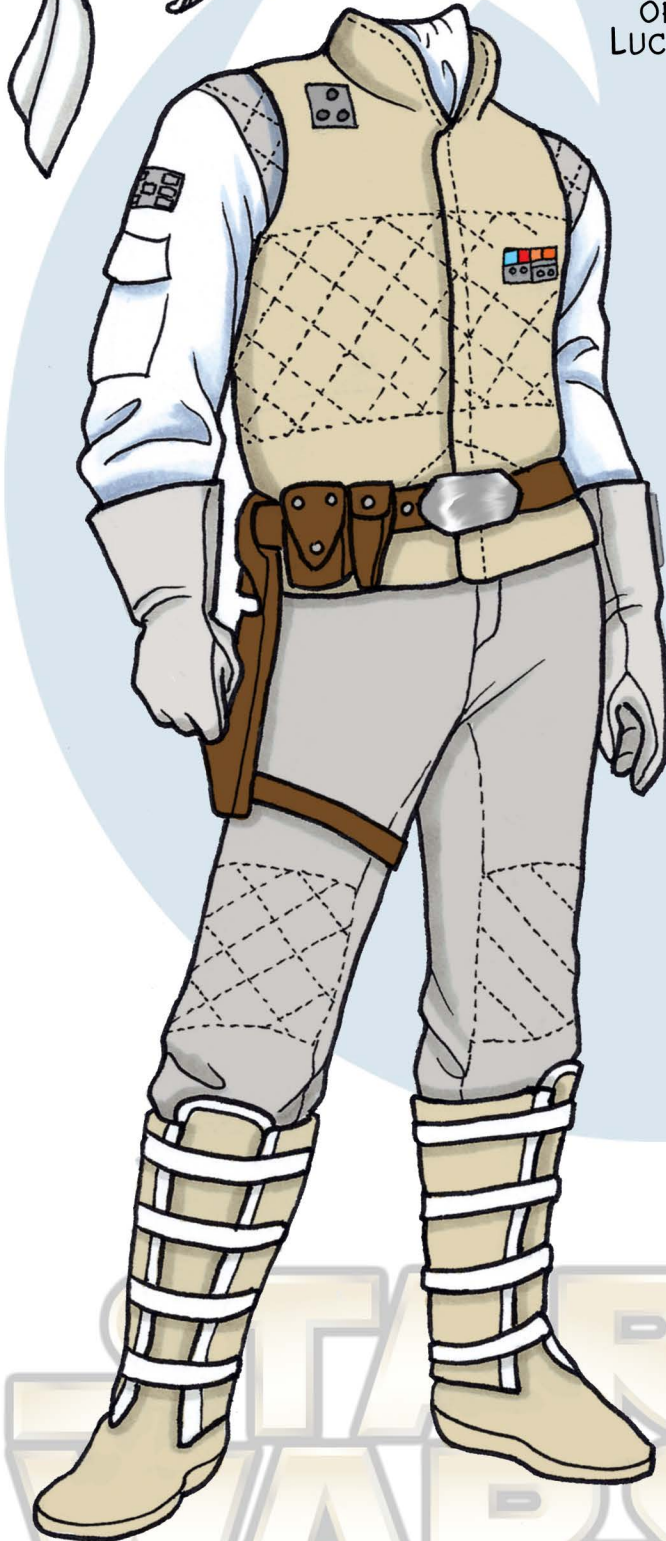
THE EMPIRE STRIKES BACK [1980]

LUKE SKYWALKER WAS CREATED BY GEORGE LUCAS, AND IS THE PROPERTY OF DISNEY & LUCASFILM, LTD.