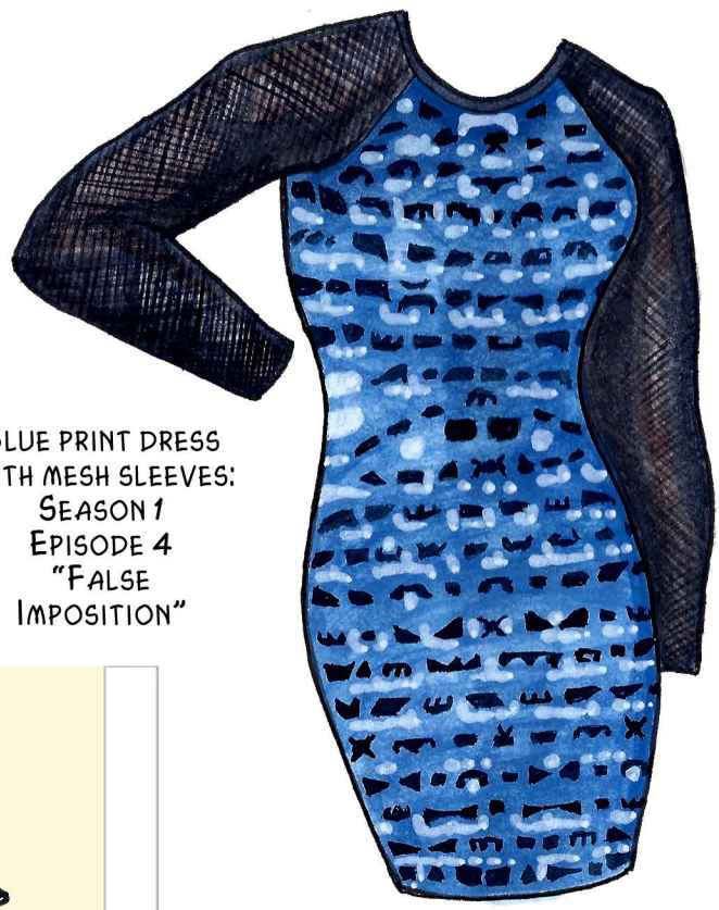
BLUE PRINT DRESS WITH MESH SLEEVES: SEASON 1 EPISODE 4 "FALSE IMPOSITION"