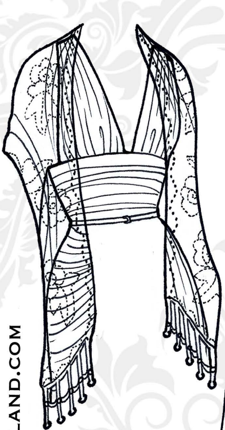
XIA VALENTINO- INSPIRED GOWN 2016